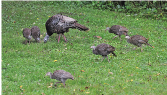
Hen turkey with poults.

The most common agricultural damage caused by turkeys is to ginseng and stored silage. Turkeys will scratch through hay (looking for insects) that is used to provide thermal protection to the ginseng root during cold temperatures. As turkeys scratch the hay off the root, the ginseng freezes and dies. This can occur in other freshly bedded crops as well. Turkeys may damage stored silage by pecking